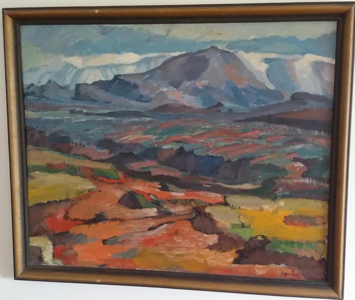
Helgafell on the wall of our living room (TF3GD and TF3DX) - by painter Ásgrímur Jónsson (1876 – 1958)

TF3DX/P Helgafell TF/SV-040 Sept 2016 rev. 2026