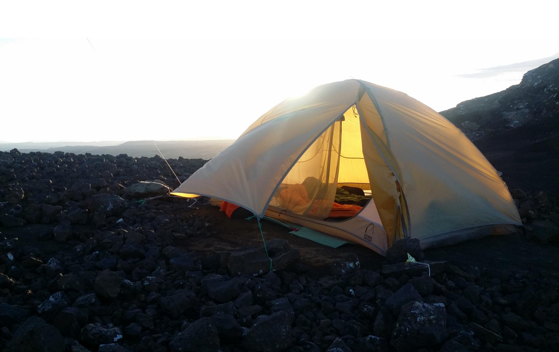
Sunrise at 6:08 seen through the tent, when occupant was forced out by his first duty of the day.