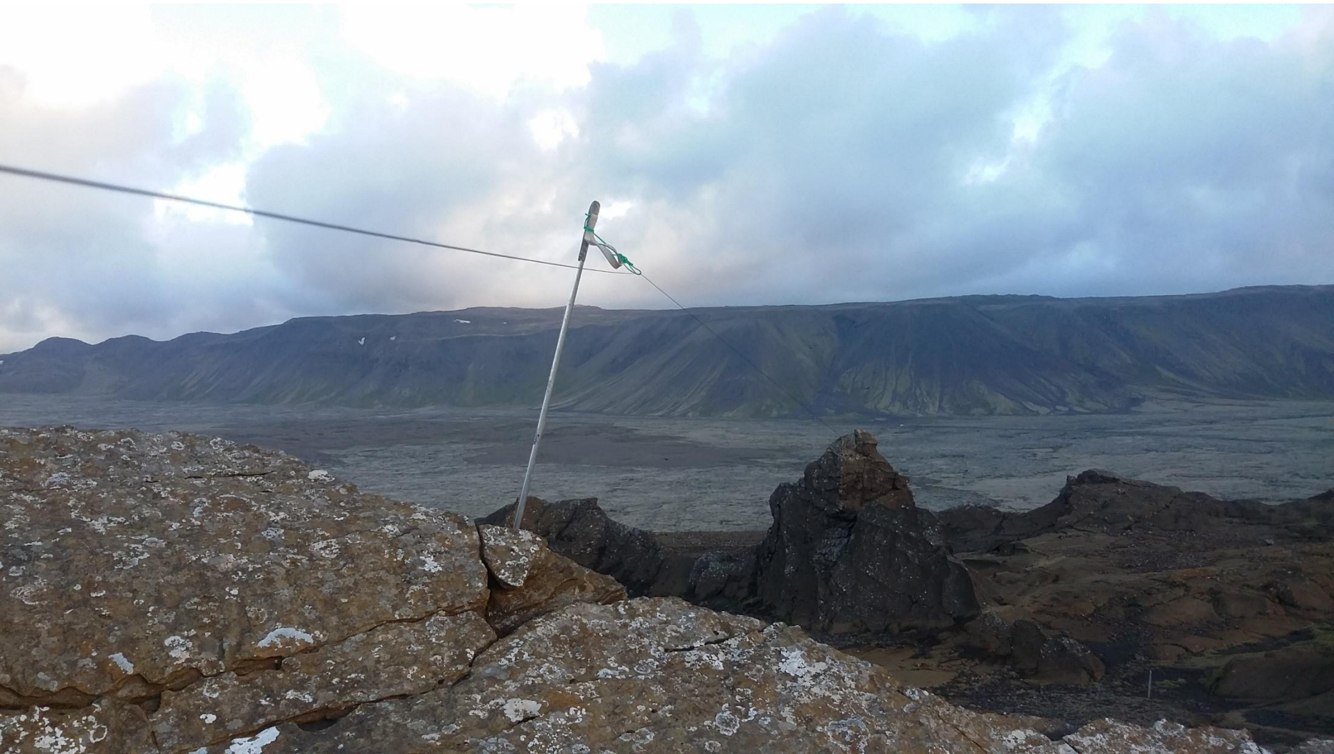
80 m \lambda/2 to sandstone pillar 70-80 m away. Excellent for inter-TF sky wave. Works well on 20 m DX too but directive.