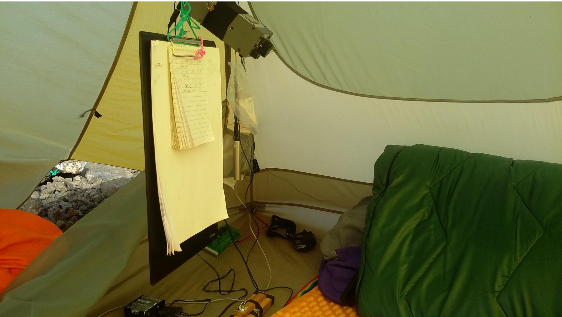
The shack for horizontal operator. Key usually resting on the chest - have had many a chat that way.