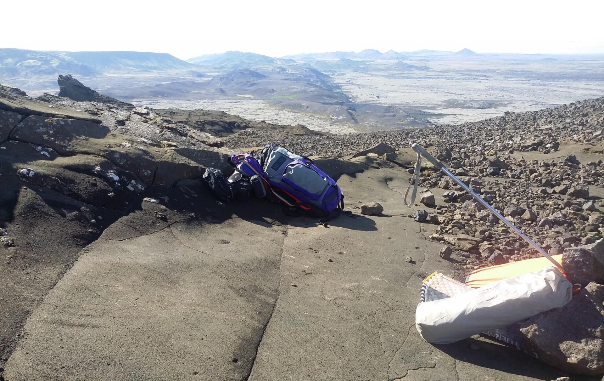
Arrived at QTH. The grey moss in the lava background tells this place from the moon.