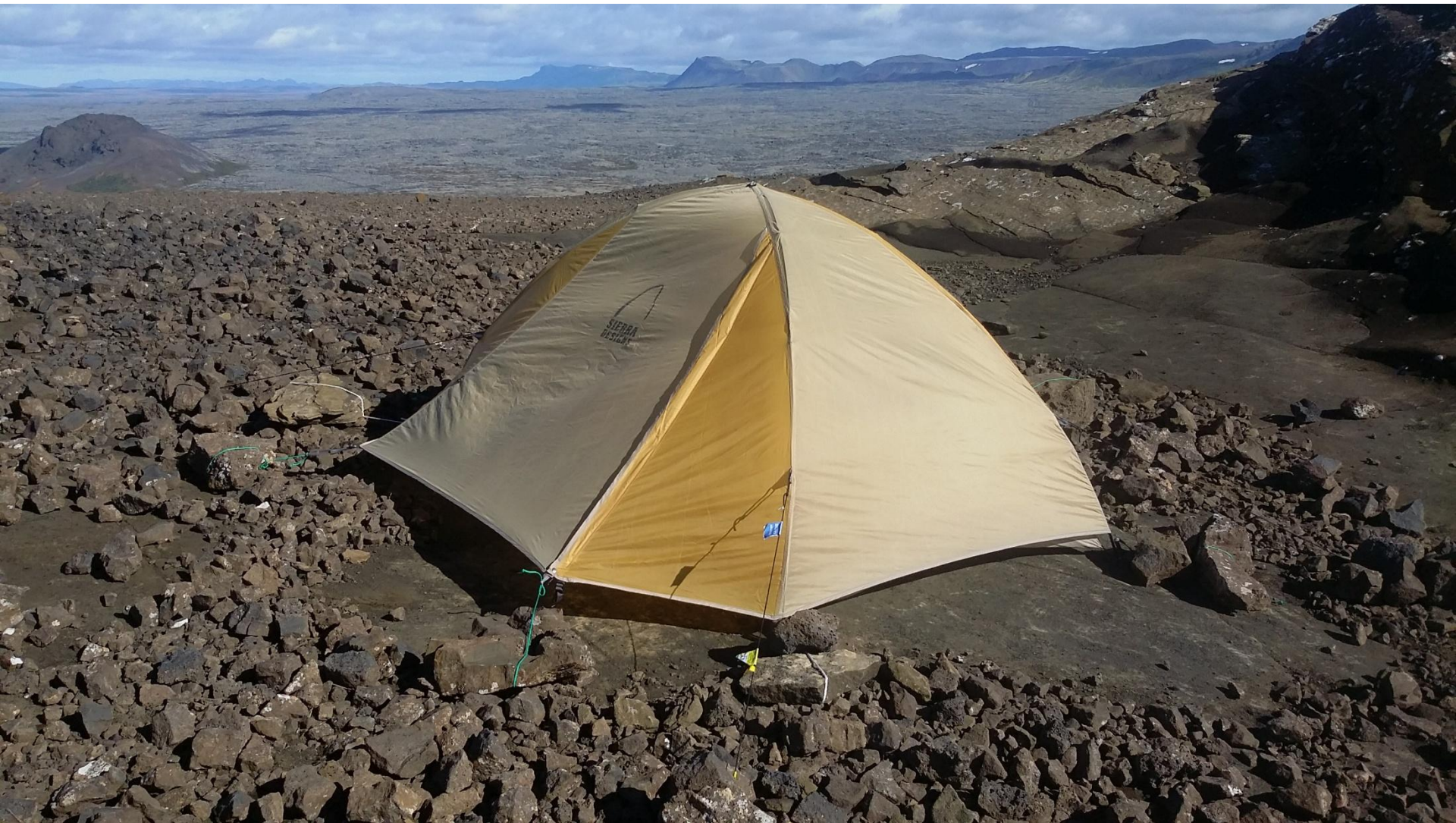
Above tent is Vífilfell, north end of the Bláfjöll (TF/SV-018) ridge extending to the right. To its left is Hengill TF/SV_009.