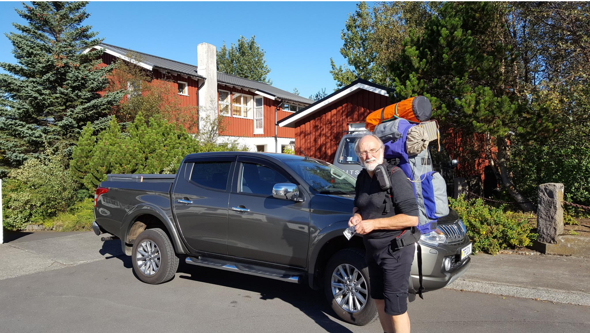
TF3DX setting out for Helgafell.